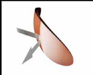
Vision Advantage PC Lens™