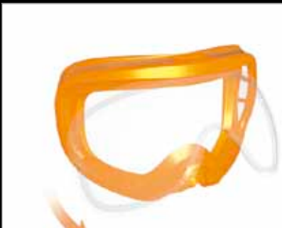
Quick-Change Lens System